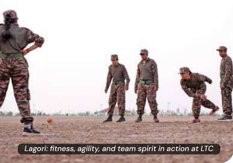
Lagori: fitness, agility, and team spirit in action at LTC