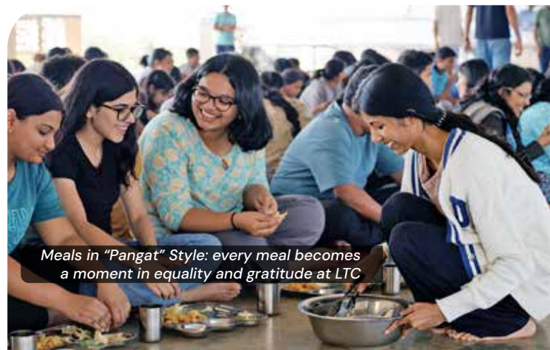
Meals in “Pangat” Style: every meal becomes a moment in equality and gratitude at LTC

Participants reconnect with Bhārat’s civilisational heritage, rediscovering identity, purpose, and reverence for land and lineage.