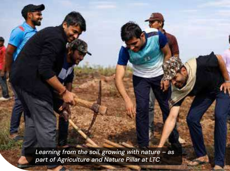
Learning from the soil, growing with nature – as part of Agriculture and Nature Pillar at LTC