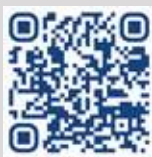
LTC Concept Film