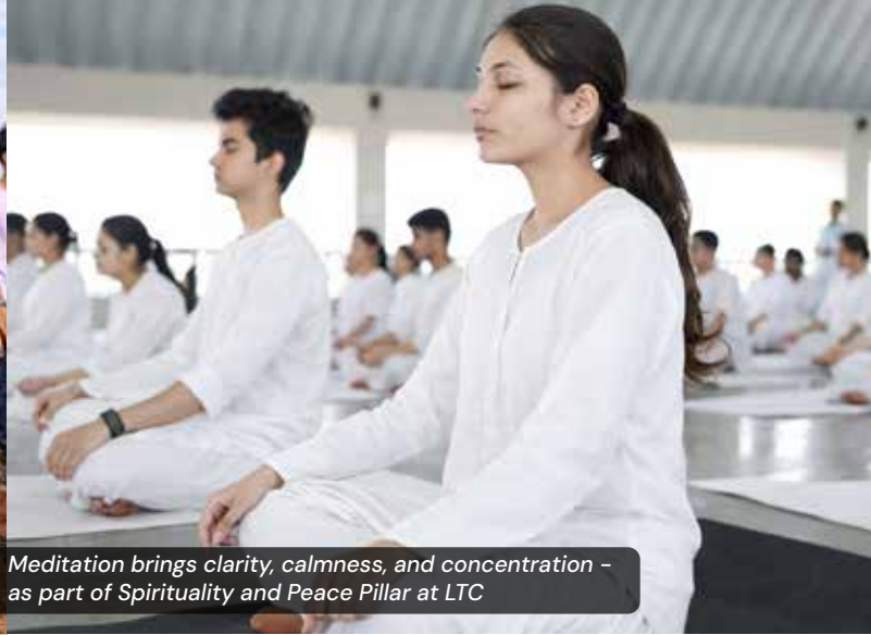
Meditation brings clarity, calmness, and concentration – as part of Spirituality and Peace Pillar at LTC