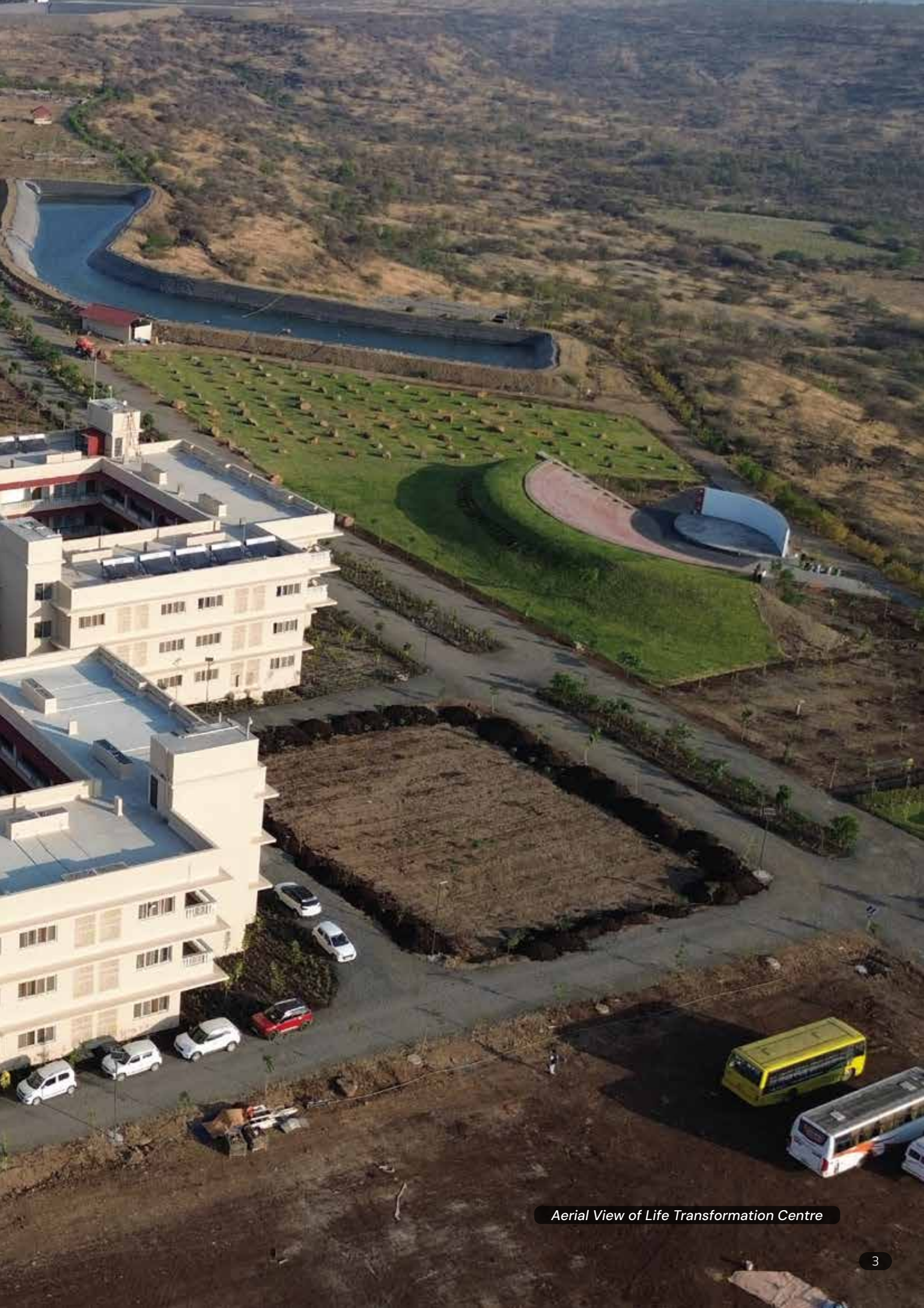
Aerial View of Life Transformation Centre