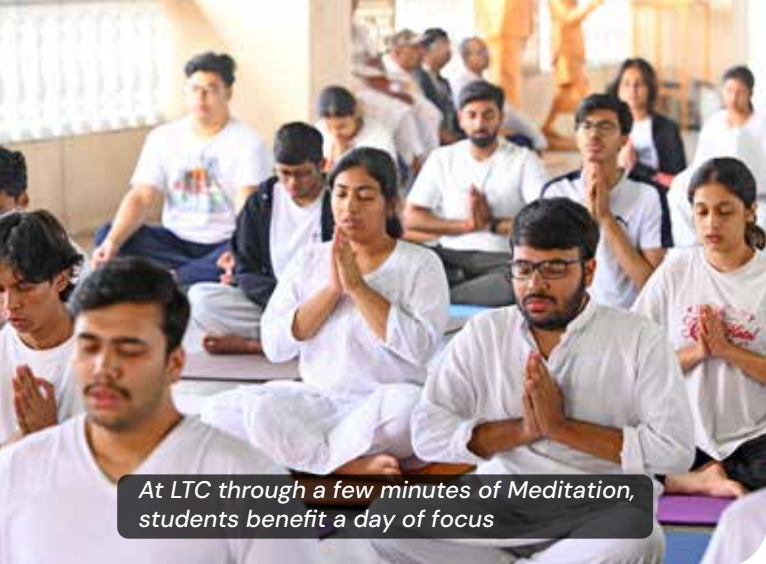
At LTC through a few minutes of Meditation, students benefit a day of focus