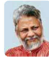
Dr. Rajendra Singh

Magsaysay Awardee, Well Known Water Conservationist (Waterman of India) & Chairman, Tarun Bharat Sangh