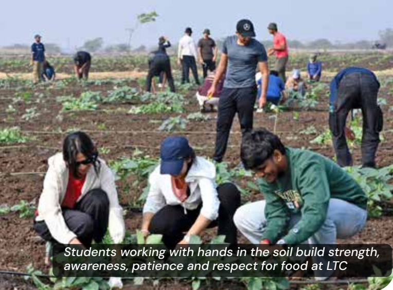
Students working with hands in the soil build strength, awareness, patience and respect for food at LTC