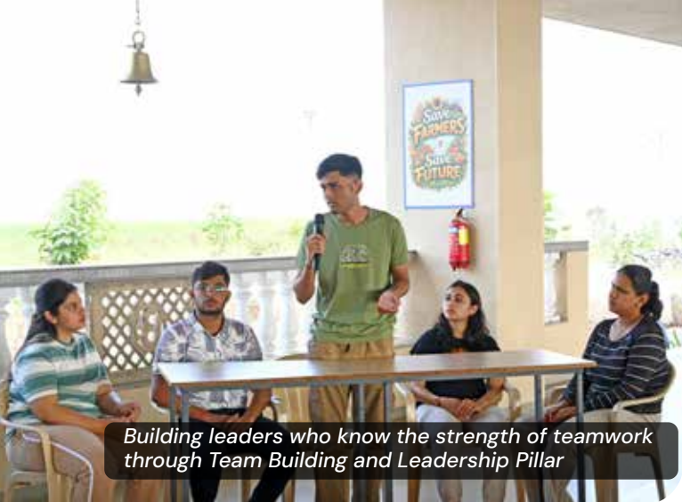
Building leaders who know the strength of teamwork through Team Building and Leadership Pillar